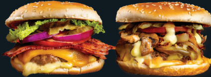
The Cheesy Bacon